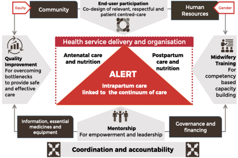
Fig. 1: Conceptual framework

"The first 1,000 days of life - Survive, Thrive, Transform